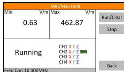
Min/Max Hold Display