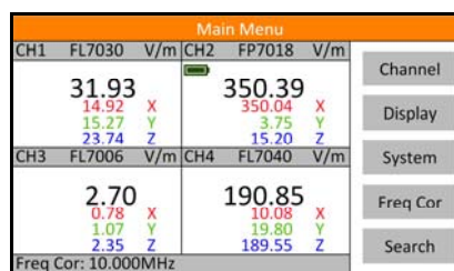
Multi-probe X,Y,Z Display