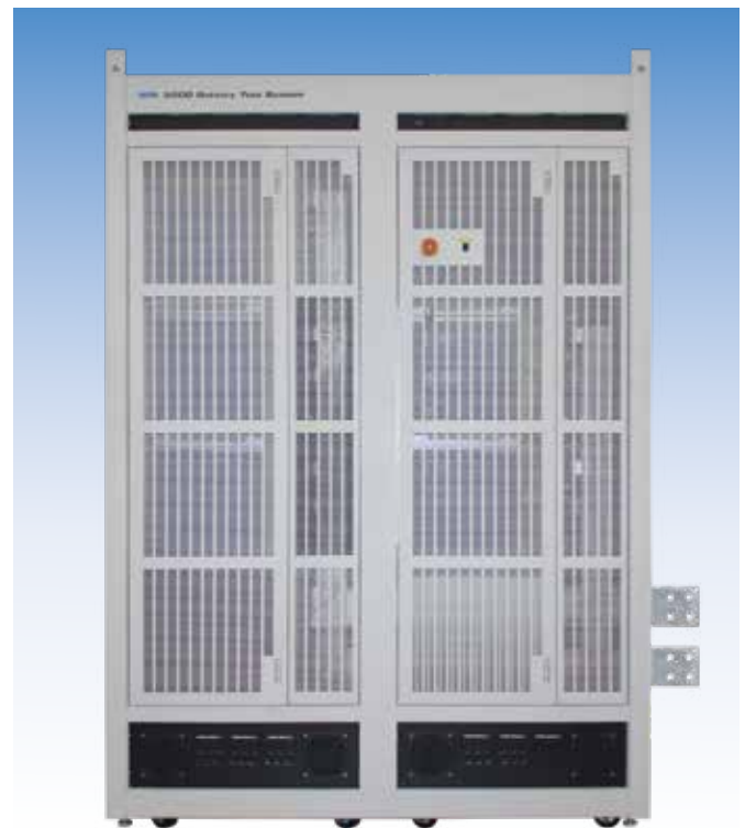
9220 Dual Bay Test System front panel view